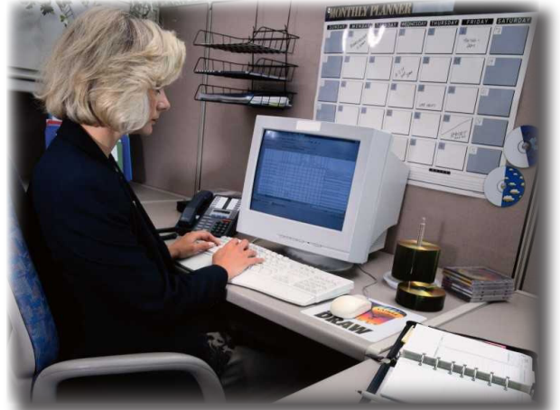
Changes made in Interact® on your office PC...