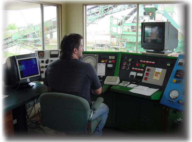
...can be exported to the scale PC with the Full Import/Export Module!